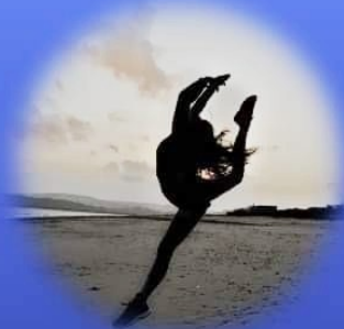
SCSD Dancer

Ballet, Tap & Disco/Street Dance Classes for children & Teenagers (Pre-school Ballet from age 2)